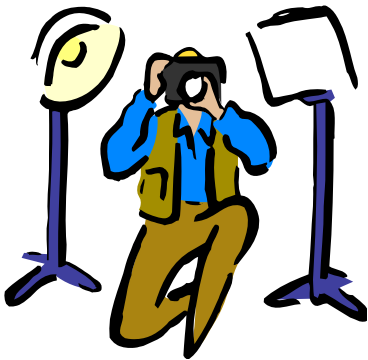
Photographer will be Cassidy Studios